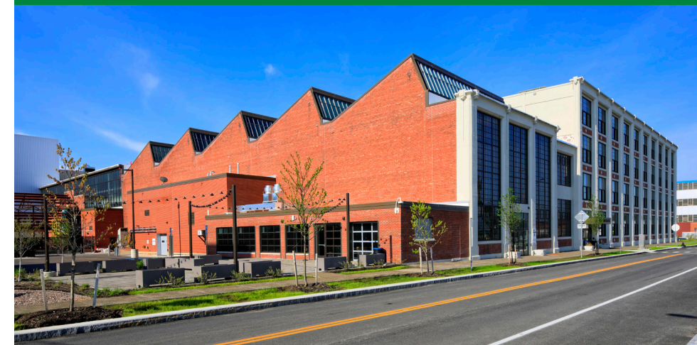
Northland Workforce Training Center $74 Million in Construction