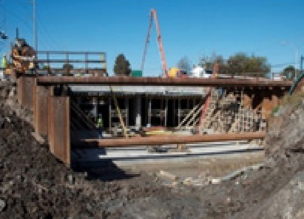
SE Louisiana Urban Flood Control Project $1.5 Billion in Construction