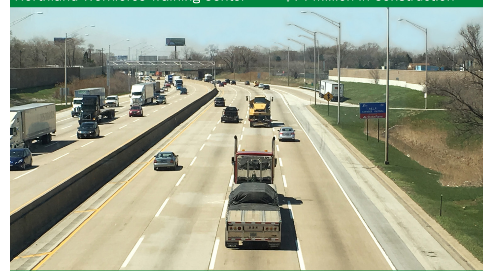
Illinois Tollway Design & Construction $100 Million in Construction