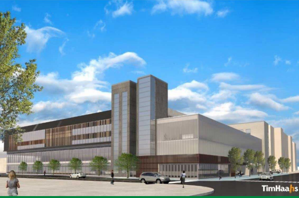
Green Street Parking Garage - Newark $30 Million in Construction