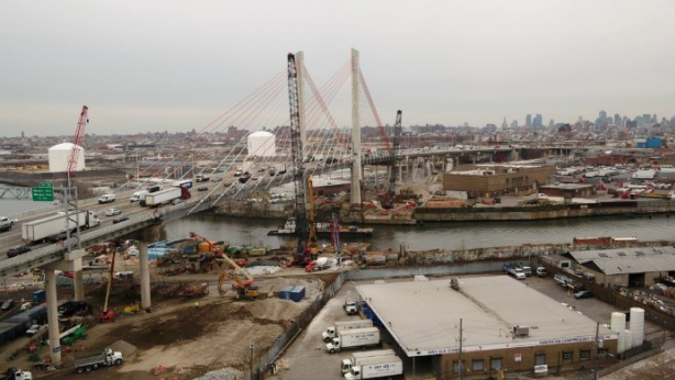
Kosciuszko Bridge over Newton Creek $900 Million in Construction