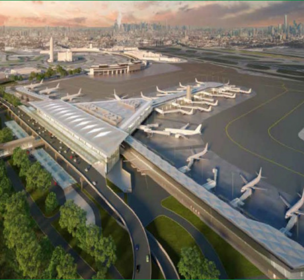
EWR Terminal 1 Conf. Center & Ped. Bridge $2.7 Billion in Construction