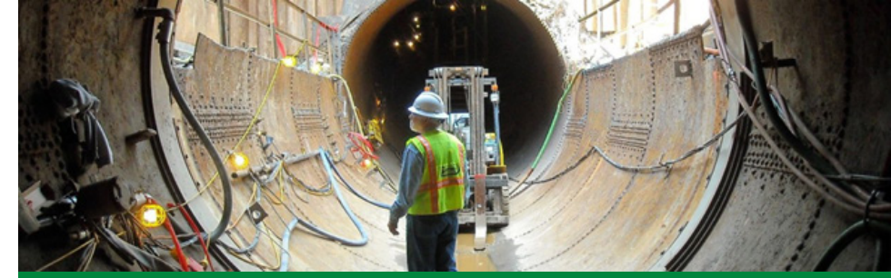
Clean Water Atlanta Management Program $3.9 Billion in Construction