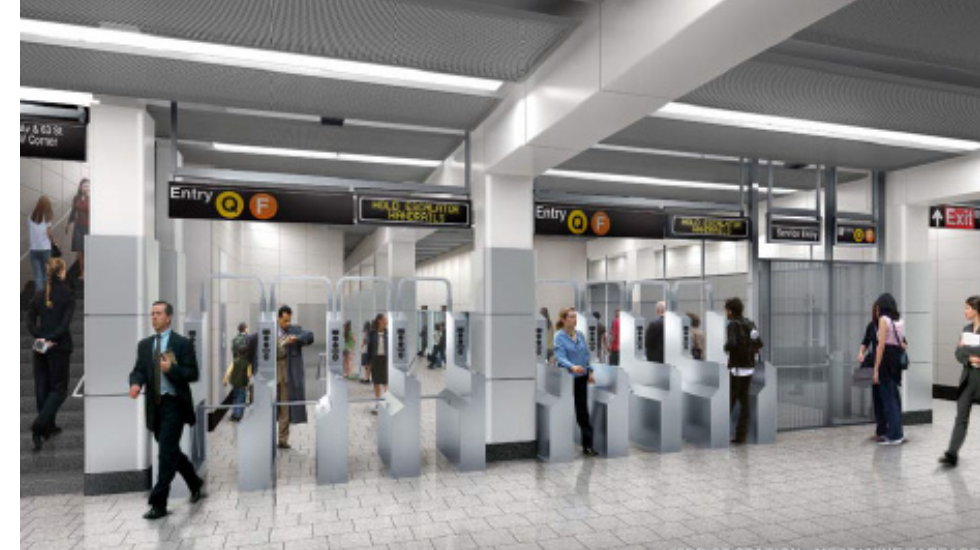
MTA Second Avenue Subway - Ph 2 $4.4 Billion in Construction